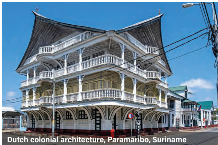
Dutch colonial architecture, Paramaribo, Suriname

Enjoy the ship's excellent facilities and attend lectures as the Vega cruises along the northeast coast of South America. (B,L,D)