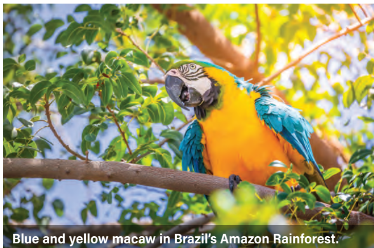
Blue and yellow macaw in Brazil's Amazon Rainforest.

Enjoy the ship's excellent facilities and attend lectures as the Vega cruises along the northeast coast of South America. (B,L,D)