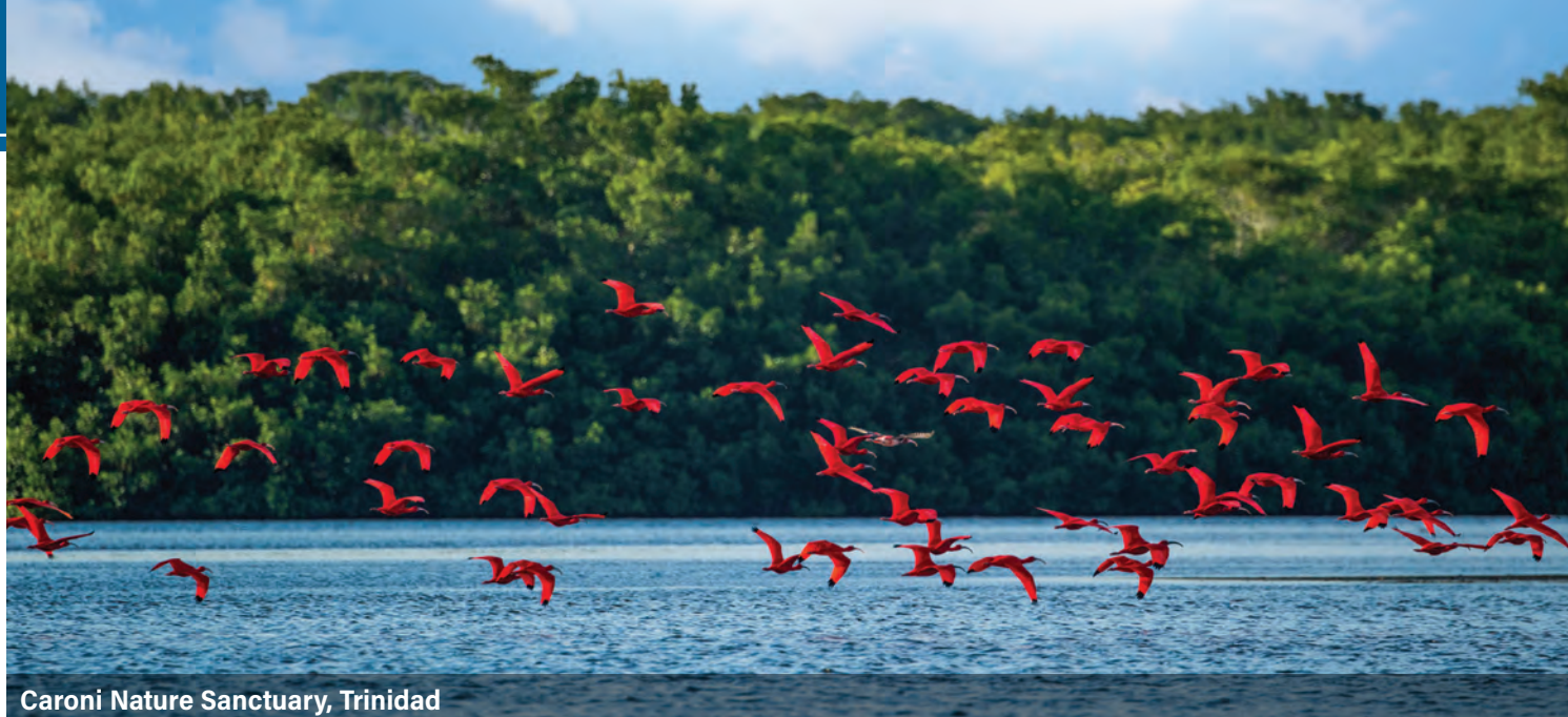
Caroni Nature Sanctuary, Trinidad