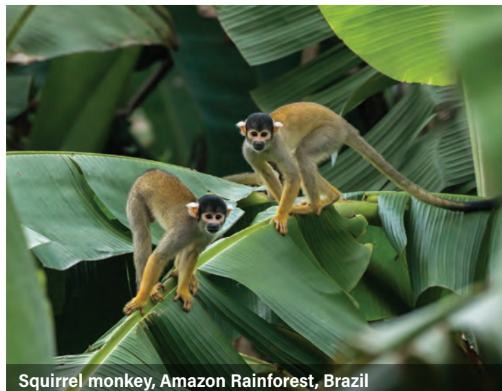
Squirrel monkey, Amazon Rainforest, Brazil