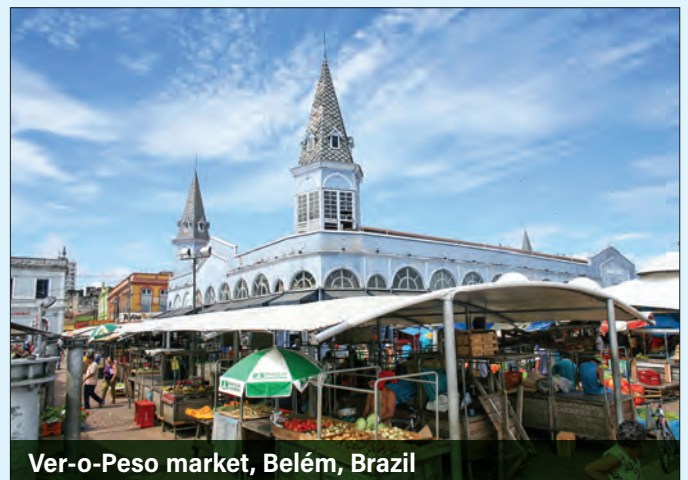
Ver-o-Peso market, Belém, Brazil