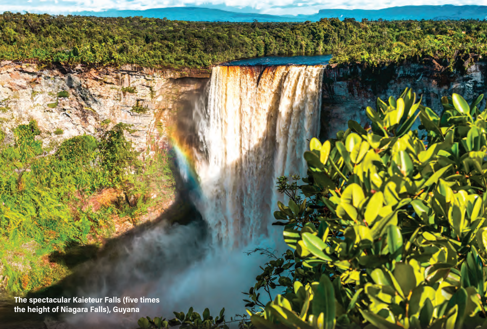
The spectacular Kaieteur Falls (five times the height of Niagara Falls), Guyana

Aboard the 76-Stateroom Expedition Cruise Ship VEGA