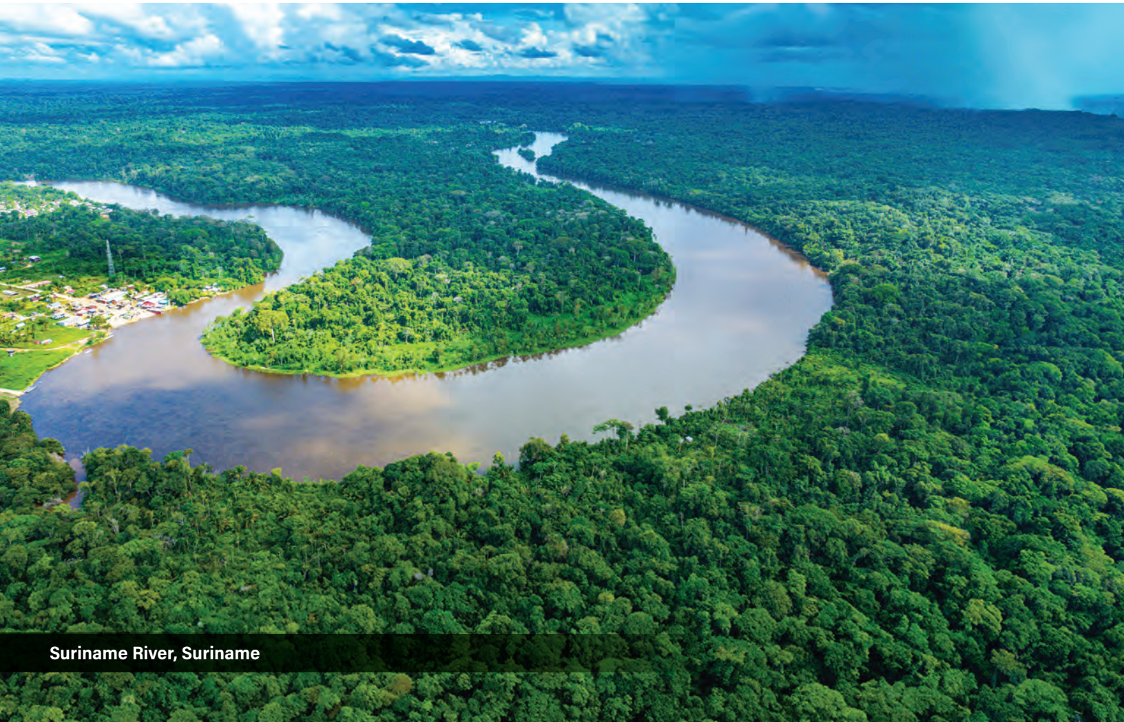
Suriname River, Suriname